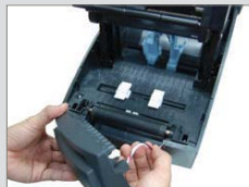
Auto-Cutter : Easy installation