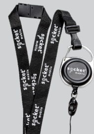
Lanyard - Black AC4100-1692