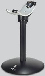
Charging Stand SKU# AC4076-1538