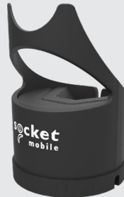
Universal Charging Dock SKU# AC4133-1871