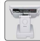
Upper I/O Panel for Easier Control