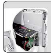
Solid AI Frame Construction (TITAN-500)