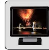
Industrial LED Display