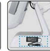
Built-in Power Adaptor