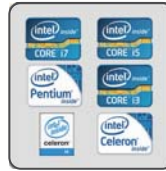
Compatible with Various CPUs