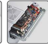
Easy Access to Motherboard (TITAN-500)