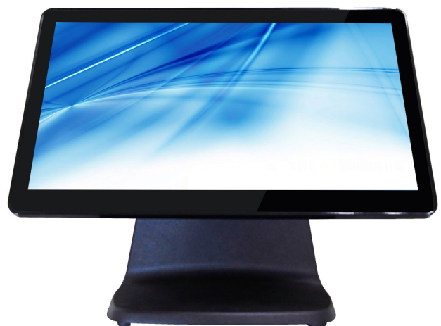
TRUE FLAT PCAP MULTITOUCH SCREEN